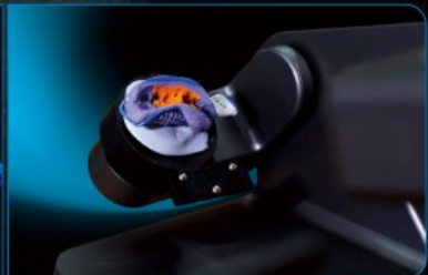
Post and Core